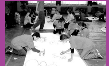
EYDP Workshops. Brussels. December 2002