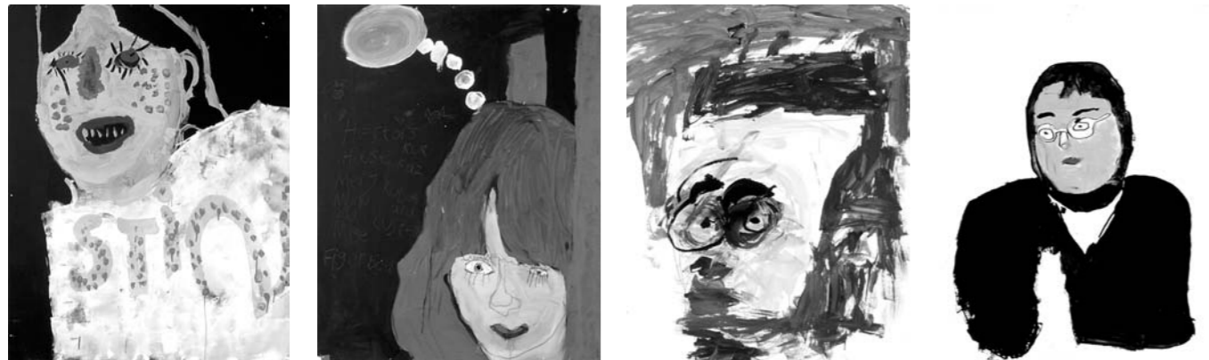
Self-Portrait paintings. Project India 2003

Art Works structured proposals and plans for the final year of the project according to available resources in direct response to the findings of this and other Art Works projects conducted since October 2000.